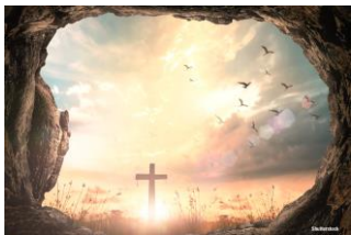
Interpretation of salvation