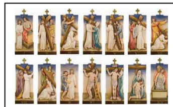
Stations of the cross