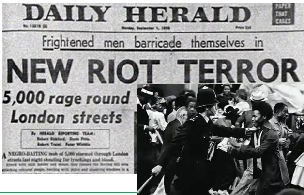
Primary sources from the Notting Hill Race Riots of 1958.