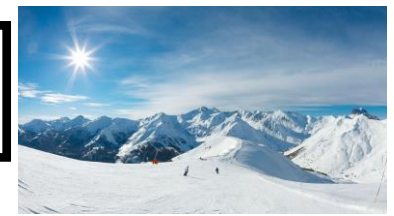
The French Alps