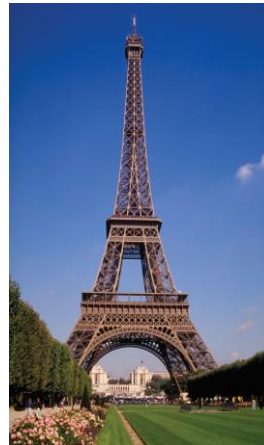
The Eiffel Tower