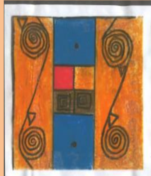
Drawing based on the work of Hundertwasser.