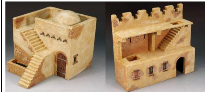
A model reconstruction of an Ancient Egyptian house